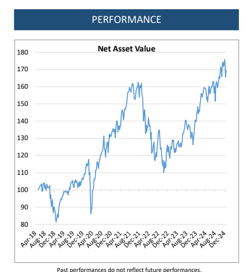
The performances are net of all costs.

The monthly top three consisted of Alphabet (+12.17%), Taiwan Semi (+7.29%), and Amazon (+5.53%). On the other side, we find Uber (-16.18%), BWX Technologies (-14.87%), and Sherwin-Williams (-14.46%).